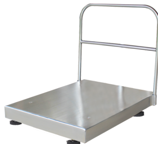
Stainless Steel Platform